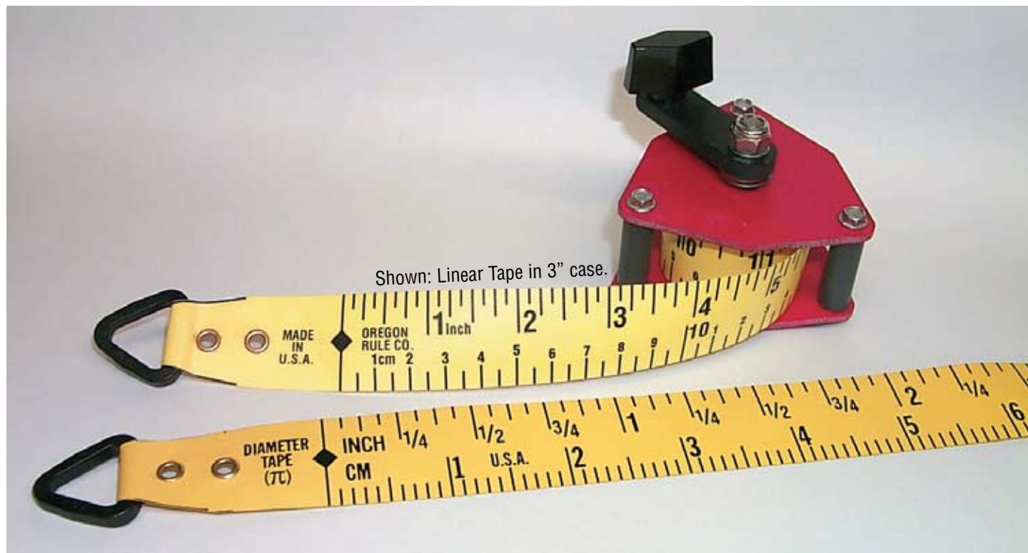
Shown: Linear Tape in 3" case.

This unique design of flat flexible measuring tapes comes in two basic styles: Direct reading Diameter Tapes (DT) for measuring round objects; Direct reading Linear Tapes (LT) originally designed for agricultural husbandry. Tapes are made of a vinyl impregnated polyester woven fiber 1.10 inches wide with easy to read graphics in both Fractional and Metric. The case is made of fiberglass reinforced plastic with stainless steel fasteners that provides rugged outdoor use. Optional selections include: Tape complete in case (HT); Replacement Tape (RT) preattached to a spool; or as a Separate Tape (ST) as an economical alternative to the case style (no triangle loop at end).